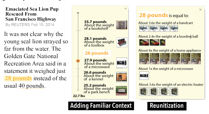
Figure 1. A text article with our automated concrete re-expression tools using two common strategies: adding familiar context (left) and reunitization (right) to provide more context for the measurements by comparing them to measurements of familiar objects.

by purchasing fruits grown in the state (300 \text{ gallons})^1 , or how high storm surge flood waters from a hurricane could rise in their area (4 \text{ ft})^2 , they may not be compelled to change their grocery list to help conserve water, or evacuate their home.