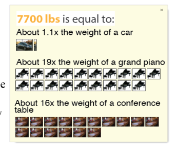
Figure 7. An example of our reunitization application. When the user selects a measurement in the text, the concrete re-expression is presented in the right sidebar.

Elephant on Weight-Loss Plan By REUTERS Feb 15. 2014 At about 7.700 pounds (3,500 kg), Tess is roughly 6 percent overweight. The elephant's weight is already at the amount it should be at the end of a healthy pregnancy and if Tess gets any larger, she may have trouble giving birth, zoo officials said.